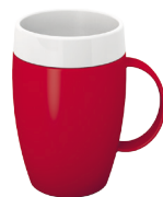
Mug with internal cone