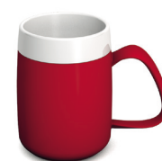
Mug with internal cone