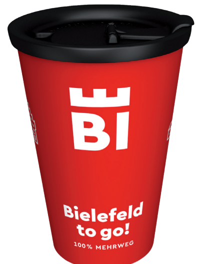
City of Bielefeld