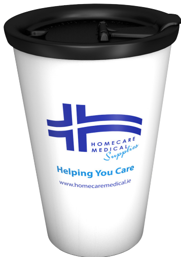
Homecare Medical Supplies

With the reusable cups by ORNAMIN there are no limits to your creativity. They can be customised with an individual and dishwasher safe decor. Here are some examples of already realised projects. For more information go to en.ornamin.com/references/ .