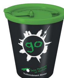
University of Münster