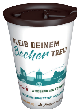
City of Mannheim

The „Bleib deinem Becher treu“ cup is part of the municipal climate protection campaign „Mannheim auf Klimakurs“.